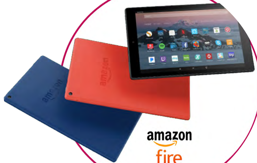
amazon fire TABLET